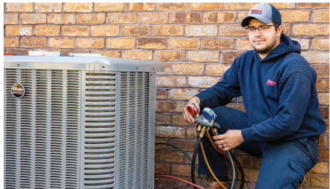
TUNED UP: An Aero Energy technician performs regular maintenance on an outdoor HVAC system to help improve its efficiency.

Next, we recommend making strategic adjustments to your thermostat throughout the day. Lowering the temperature while you're asleep or away from home can have a significant impact on your bill. For those interested in automating this process, there are smart thermostats