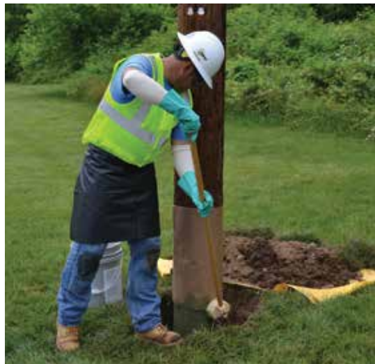
POLE TEST: An Osmose Utility Services Inc. crew member inspects poles and treats the bottom of the pole with a safe chemical solution.

inspection takes place. We also plan to post reminder notifications on the co-op's website, adamsec.coop , and social media sites when the contractor crew moves to its next location.